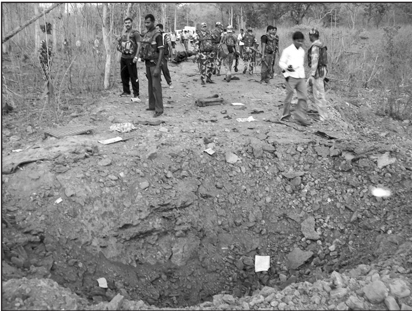
Figure 9. Crater caused by landmine blast in Bijapur district of Chhattisgarh.

The progress in clearing the areas, however, has been slow due to a number of factors. 74 Some chief ministers have reservations about the federal government approach. The chief minister of Bihar, speaking on 14 July 2010, said that enforcement action alone would lead to greater alienation of such elements “making heroes out of the leaders of the extremist organizations and leading to only symptomatic treatment, leaving the underlying disease to reappear in a more virulent form.” 75 Besides, some allies of the government like Mamta Banerjee’s Trinamool Congress, have been maintaining an ambivalent attitude towards the Maoists. There is also inadequate coordination between the central and the state forces. This was particularly