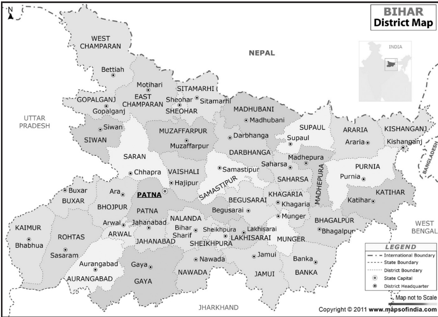
Figure 2. Districts of Bihar. Map used by permission of Maps of India.

In the early stages, Naxalite activities in the area were confined to three villages with Gangapur as the center. In April 1968, the peasants of Gangapur harvested the arahar (a kind of lentil) crop of the landlord in broad daylight. This was the starting point of trouble. Retaliation was quick. Bijli Singh, the zamindar (landlord) of Narsinghpur, organized an attack on the peasants with 300 men armed with lathis (sticks), spears, swords, daggers, and firearms. The landlord himself came on an elephant and brought two cartloads of stones. 16 A bizarre fight followed and it went on for about four hours. The landlord and his hoodlums eventually fled.