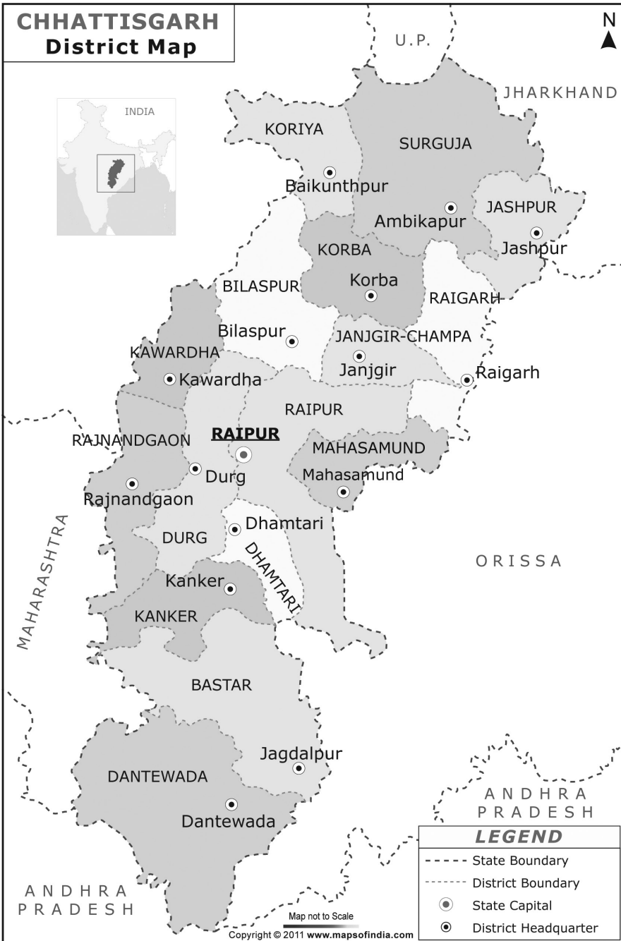
Figure 5. District of Chhattisgarh. Map used by permission of Maps of India.