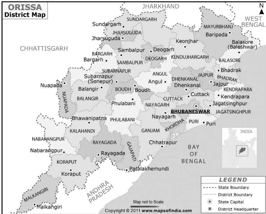
Figure 3. Districts of Orissa. Map used by permission of Maps of India.

In Madhya Pradesh, the districts of the Chhattisgarh region, namely Raipur, Durg, Bastar, Bilaspur, Sarguja, and Raigarh were affected. Party cells were formed in these districts under the guidance of Jogu Roy, the CPI (ML) leader of the region. Members of tribes in Bastar area were particularly receptive to Naxalite propaganda as they nursed a feeling of neglect by the state government. Naxalite posters could be seen in Jagdalpur, the district headquarters.