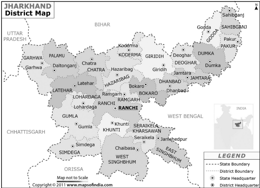
Figure 6. District of Jharkhand. Map used by permission of Maps of India.