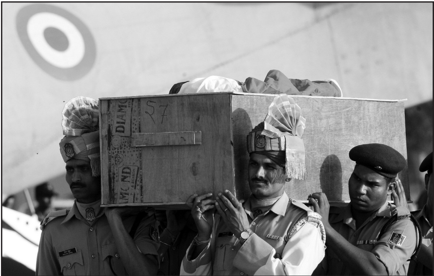
Figure 4. Central Reserve Police Force officials carry the coffins of Indian police officials who were killed during an ambush by Maoist guerrillas.

The year 2008 continued to witness intensified Naxalite violence: the ultras attacked Nayagarh town in Orissa on 15 February and overran three police stations, killing 13 policemen and 2 civilians. They also decamped with 1,100 weapons, though police were able to recover about half of them; on 29 June, 35 security forces personnel belonging to the Greyhounds (elite anti-Naxal force) of Andhra Pradesh police were killed/drowned in an attack on a combined group of Andhra and Orissa police in the Chitrakonda