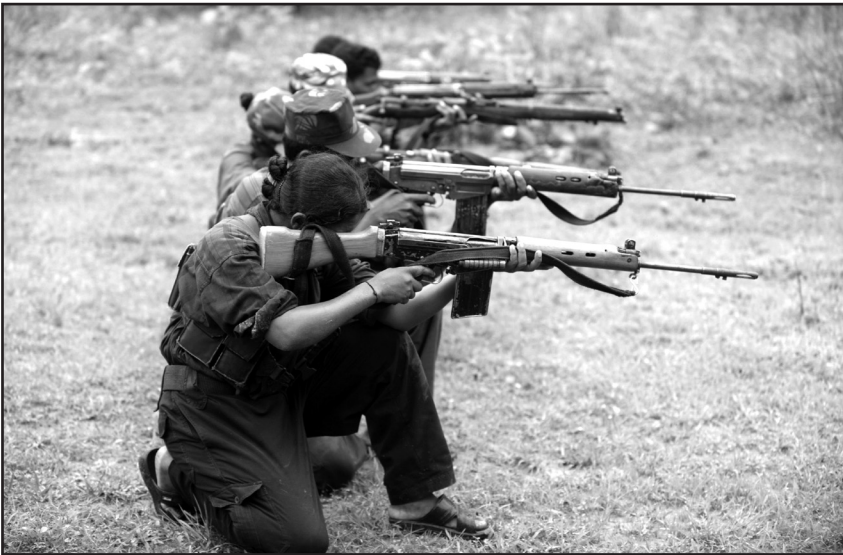
Figure 10. Indian Maoists ready their weapons as they take part in a training camp in a forested area of Bijapur District in Chhattisgarh.

Kobad Gandhi were released from custody. In a gesture of one-upmanship, Maoist leader Kishenji said on 17 August 2010 that they were prepared for peace talks on the condition that the government agreed to a three-month cease-fire and a judicial probe into the death of Maoist leader Azad, who was killed in an encounter with the police on 2 July 2010. The government rejected the offer on the ground that they had not received any formal communication from the CPI (Maoist) nor had the ultras abjured violence. The government blamed the Maoists for trying to “create confusion and buy time for themselves amid an intense offensive against them from security forces.” 85