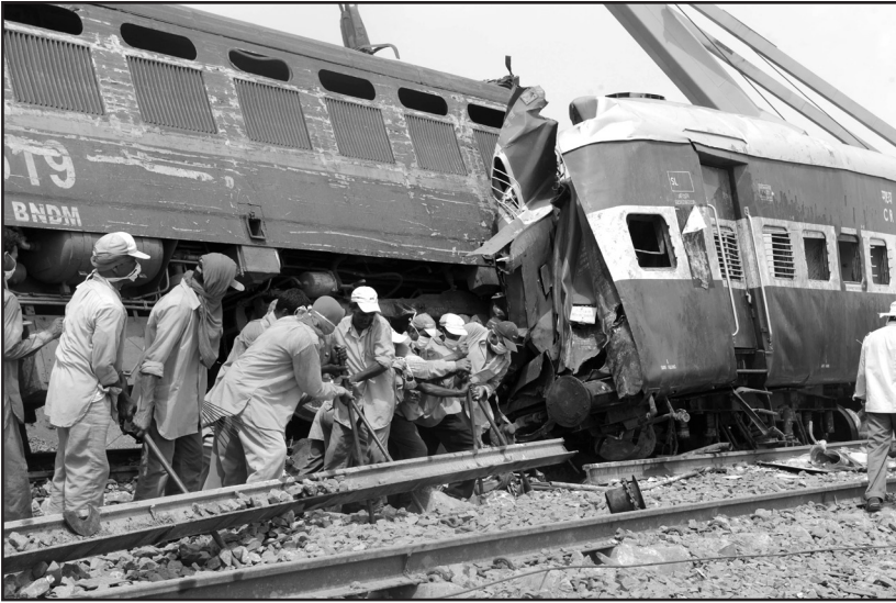
Figure 8. Trains are a favorite target of Maoists.

by the Maoists, which led to 217 disruptions in the movement of trains and cancellation of 416 trains.