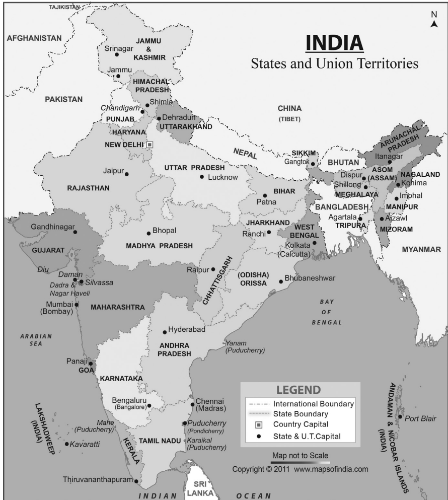
Figure 1. Map of India. Used by permission of Maps of India.

This monograph seeks to provide a concise but thorough history of this movement, and the government's response, from the movement's inception to the present day.