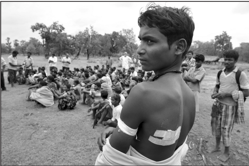
Figure 11. An Indian villager reveals his wounds after being injured in an encounter between Maoist rebels and security forces in Chhattisgarh.

The background of Salwa Judum must be understood. The Naxals were, to start with, welcomed by the Bastar tribals of Chhattisgarh because they were harassed by corrupt revenue, police and forest officials, and exploited by the traders from plains areas. However, in due course, as the Naxals entrenched themselves in the region, they started showing insensitivity to the tribals' feelings, and started interfering with their social customs and cultural practices. Ghotuls (youth dormitories) were closed. Weekly bazaars were looted. Traditional celebrations at the time of marriage were discouraged. Village priests were driven away. All this hurt the tribals and there was a feeling of resentment. The proverbial last straw was when the Naxals did not allow the tribals to pluck tendu leaves. This was a regular source of income to them. Enough was enough, the tribals felt. The public resentment against Naxals came out in the open in Kankeli, a village in the Bijapur district, in the first week of June 2005 when the villagers held a