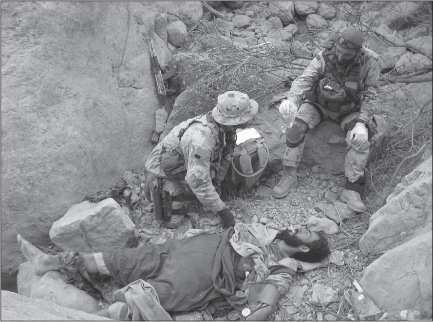
Figure 10. Taliban fighter receiving first aid prior to evacuation from the battlefield, 2005.