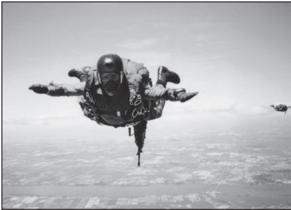
Figure 7. A member of Pathfinder platoon, the Cdn AB Regt, practices a freefall insertion into a denied area.

Continued downsizing of the Regiment to battalion status in 1992 further degraded both the status and capability of the Cdn AB Regt. Nonetheless, in December of that year, the Cdn AB Regt deployed to Somalia on a