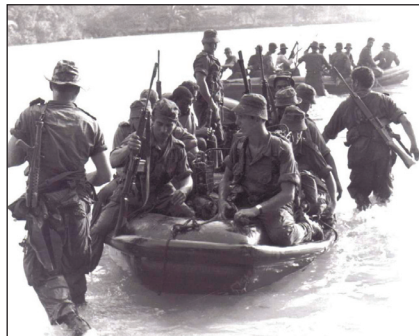
Figure 6. Paratroopers from the Cdn AB Regt conduct counter-insurgency operations in Jamaica, April 1972.

At this point, the nation’s SOF lineage went into a hiatus. Neither the existence of the MSF or its successor, the Defense of Canada Force, represented any form of a SOF capability. For that matter, arguably, neither even provided a real airborne capability. As always, external factors influenced internal organizational shifts. By the early 60s the notion of an Army rapid reaction and Special Forces capability gathered momentum, largely fuelled by the American involvement in Vietnam. In 1966, Lieutenant-General Jean Victor Allard, the new Commander of Force Mobile Command (FMC – i.e. Canadian Army) decided that the Canadian Army would develop a similar capability. Specifically, he aimed to have a completely air-portable unit, with all its equipment, deployed and in the designated operational theater as quickly as 48 hours. Therefore, on 12 May 1966, the MND announced, “FMC would include the establishment of an airborne regiment whose personnel and equipment could be rapidly sent to danger zones.” 82