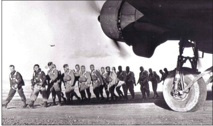
Figure 3. Members of the FSSF loading a Douglas C-47 aircraft to qualify as parachutists, August 1942.

Interestingly, in July 1942, at the same time as 1 Cdn Para Bn was established, the Canadian War Cabinet authorized a second “parachute” unit, designated the 2nd Canadian Parachute Battalion (2 Cdn Para Bn). The name of this unit, however, was misleading. It was not a parachute battalion at all, but rather a commando unit. The designation was assigned for security reasons to cover the true nature of its operational mandate. 48 On 25