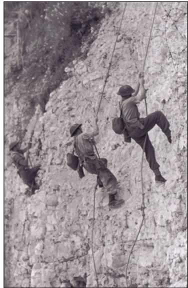
Figure 1. Canadian volunteers undergoing grueling commando training - scaling near vertical cliffs.

The SOE, however, was not the only innovative, unconventional effort. In a remarkable display of military efficiency, by 8 June 1940, two days after Churchill’s directive, General Sir John Dill, the Chief of the Imperial General Staff, received approval