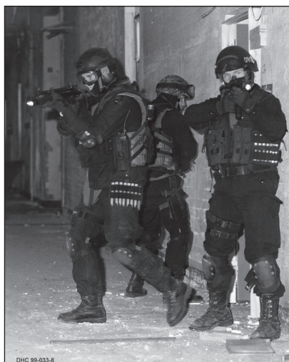
Figure 8. JTF 2 members in their black role practicing a hostage rescue.

Although the unit was expanding to include a green component, as already mentioned, its focus was still almost exclusively on black skills. A "green phase" during initial training was largely an introduction to field-craft for the noncombat arms volunteers. Within the unit there was also