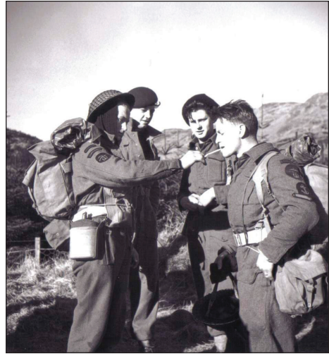
Figure 2. Members of RCN Beach Commando “W” take a cigarette break after a two-day training march, February 1944.

RCN Beach Commando “W” was assigned to Force “J” on Juno Beach during the Normandy invasion on 6 June 1944 and served with valor and distinction. Canadian newspapers quickly trumpeted the role of the Beach Commandos and described them as the “leather tough Canadians” and “tough, scrappy and self-reliant.” 41 Beach Commando “W” was disbanded at the end of August 1944.