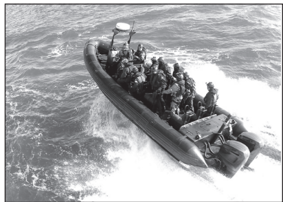
Figure 9. Members of JTF 2 conducting a maritime counterterrorism exercise.

Similarly, General Ray Hennault, the CDS at the time, asserted, “The presentation of the U.S. Presidential Unit Citation to members of JTF 2 brings important recognition to a group of incredible CF members whose