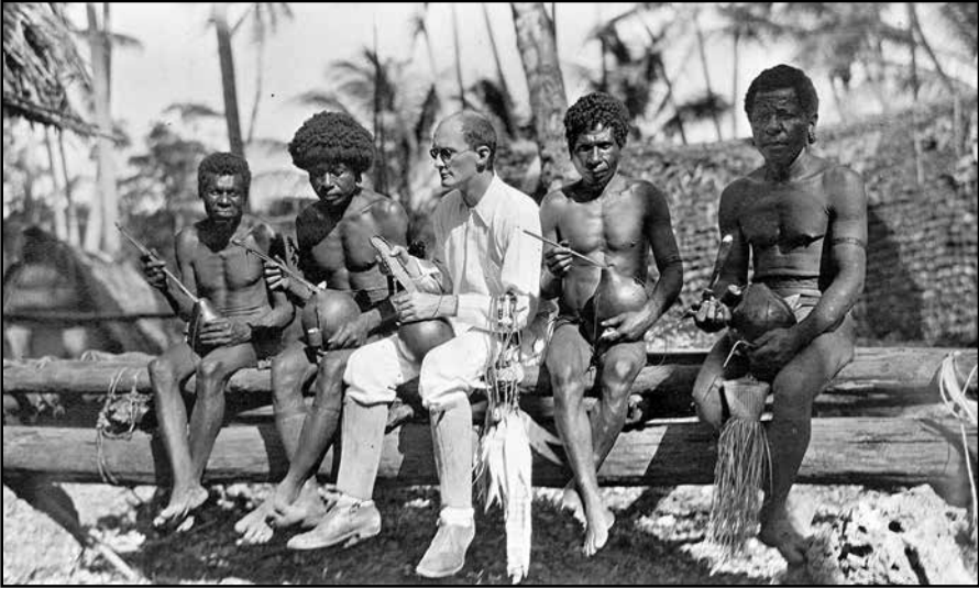
Figure 1. Bronislaw Malinowski sits with natives on Trobriand Islands in 1918.

method includes interviewing key informants, sometimes referred to as gatekeepers, or in military parlance, key leader engagements. Introductions to informants result from extended interaction with community members. Participation and observation provide the ethnographer checks and balances on what has been recounted by others, ensuring another filter of validity (validity is addressed in chapter 6).