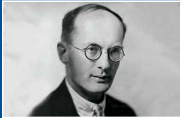
Bronislaw Malinowski, professor of anthropology, pictured in 1930.